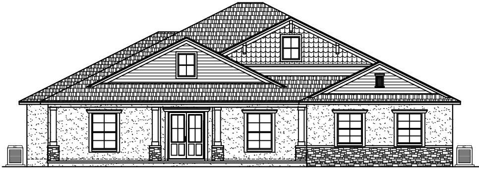
THE MELBOURNE (73'-10"W X 103'-0"D) © COPYRIGHT TRINITY DRAFTING LLC